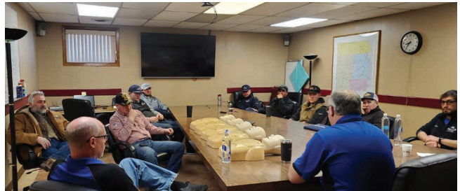
Crews meet regularly to practice safety, such as this recent first aid certification training.

Line crews work around the clock, sometimes in difficult and dangerous conditions, to keep power flowing to our