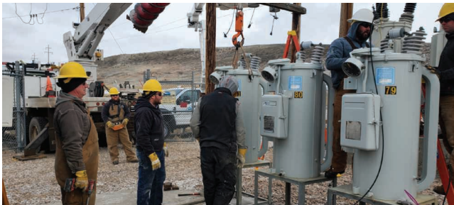
M-G crews installing new voltage regulators.