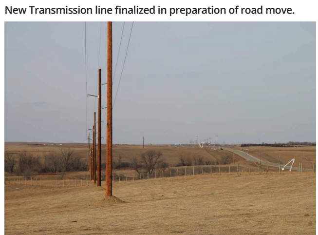
New Transmission line finalized in preparation of road move.