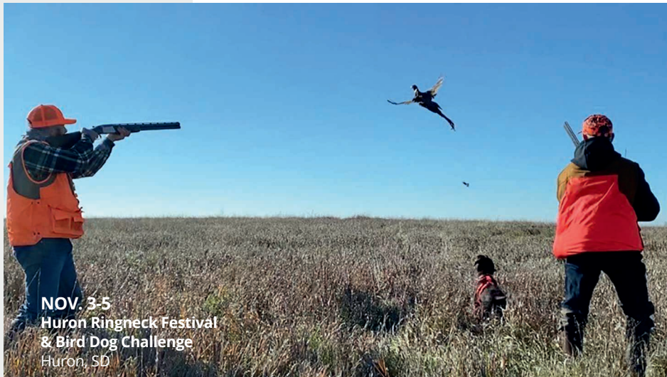
NOV. 3-5 Huron Ringneck Festival & Bird Dog Challenge Huron, SD

To have your event listed on this page, send complete information, including date, event, place and contact to your local electric cooperative. Include your name, address and daytime telephone number. Information must be submitted at least eight weeks prior to your event. Please call ahead to confirm date, time and location of event.