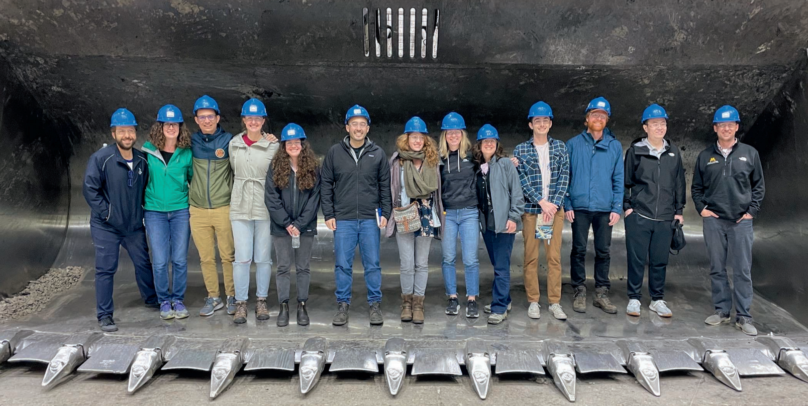
University of Minnesota graduate students pose in a massive coal bucket during an electric cooperative tour sponsored by Renville-Sibley CPA and the university.