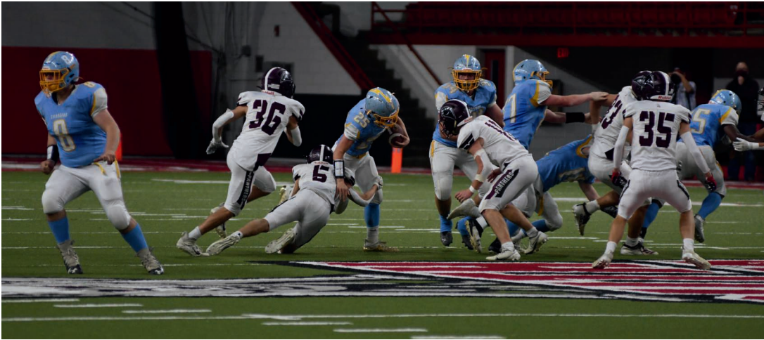
Officials at the SDHSAA say they plan to resume a normal slate of events this fall.

as the pandemic ran its course,” he said. “We listened to those in the health profession for their recommendations based on what they were experiencing and balanced that with recommendations and observations that were coming from other quarters. The governor’s office trusted us and gave us the space we needed to make the best decisions.”