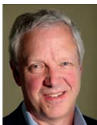
Pat Keegan Collaborative Efficiency

Good questions! An uninsulated outbuilding can be quite expensive to heat (or cool) depending on where you live. Even though we're currently experiencing July's warmer temperatures, I'll focus on heating since your shed includes the wall heater.