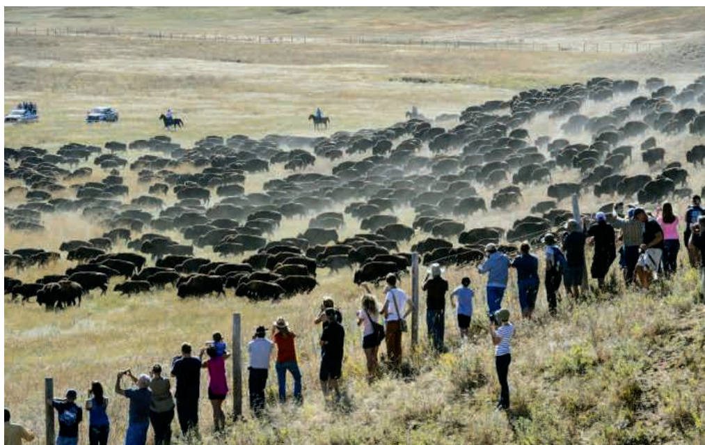
The Custer State Park Buffalo Roundup each September is popular with tourists and helps the state manage the bison that live in the park.

To learn more about the Custer State Park Bison Center, visit gfp.sd.gov/csp-bison-center/ .