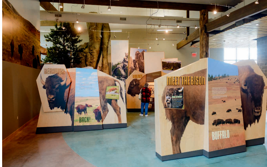
The Custer State Park Bison Center helps educate visitors about the history and importance of the herd of 1,400 buffalo that live in the park.

The biggest day of the year for the Bison Center comes in September during Custer State Park's annual Buffalo Roundup and Arts Festival. This year's event is scheduled for Sept. 28-30. The roundup itself is Sept. 29. Parking lots will open at 6:15 a.m. Mountain Time for people