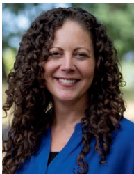
Miranda Boutelle Efficiency Services Group

A: The energy a residential well system uses depends on the equipment and water use. The homeowner is responsible for maintaining the well, ensuring drinking water is safe and paying for the electricity needed to run the well pump. Here are steps to improve and maintain your residential well and use less electricity.