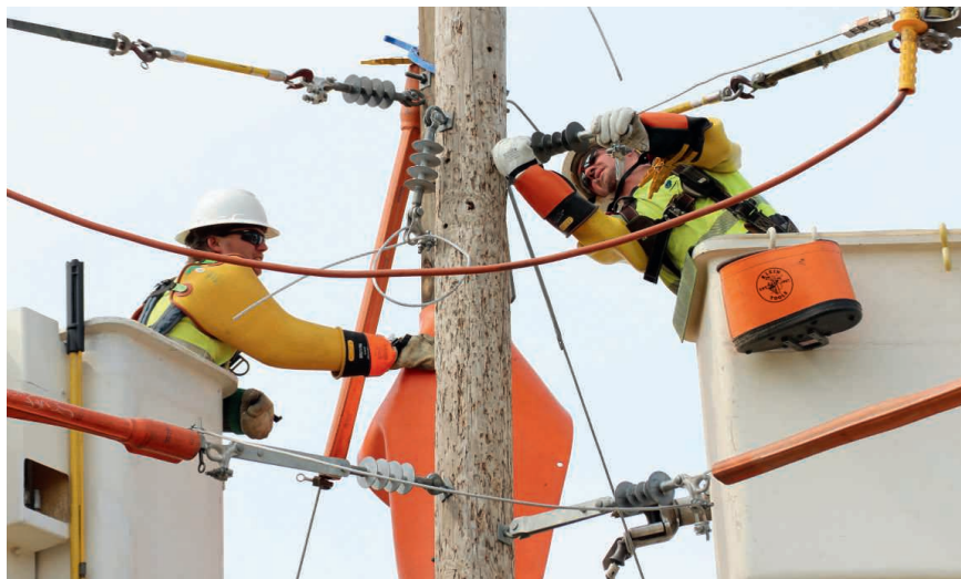
MTC is a prime training ground for future co-op linemen.

For more information about MTC, visit www.mitchelltech.edu .