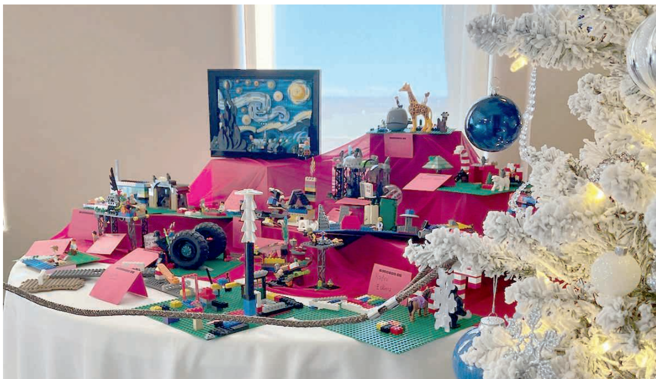
This display was created by the local Lego club and attracted a lot of interest during the Christmas season.