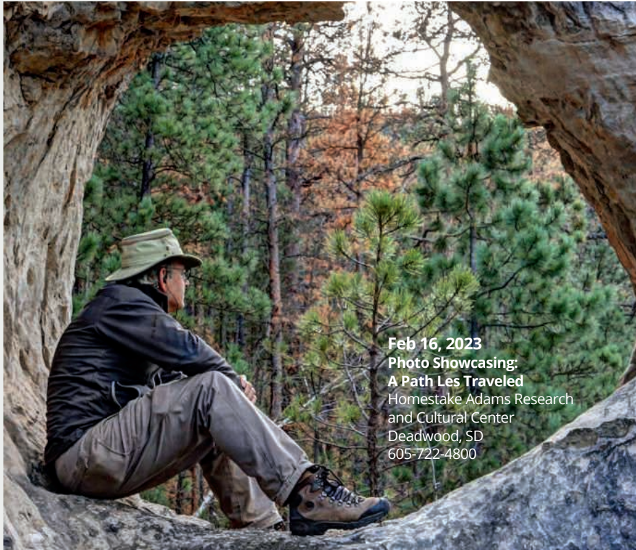
Feb 16, 2023 Photo Showcasing: A Path Les Traveled Homestake Adams Research and Cultural Center Deadwood, SD 605-722-4800

To have your event listed on this page, send complete information, including date, event, place and contact to your local electric cooperative. Include your name, address and daytime telephone number. Information must be submitted at least eight weeks prior to your event. Please call ahead to confirm date, time and location of event.