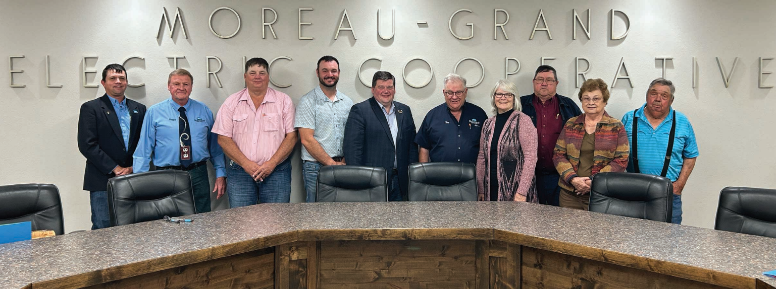
MGEC Board of Directors