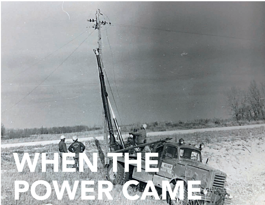
Rosebud Electric Cooperative providing power in the early days.